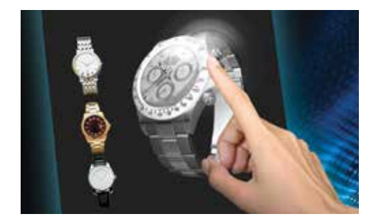
Retail Stores & Exhibitions