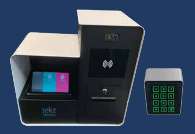
Top Left: HOLO Library registration and check-out stand, Top Right: HOLO building entry keypad