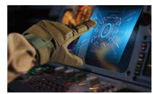
Military & Industrial