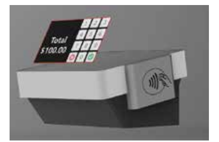
Top, left to right: 200mm demo, 250mm red custom demo, 310mm programmed demo without and with NFC Card Reader.