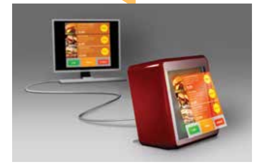
The units are connected to the restaurant's networks via USB and HDMI cables. Add NFC or card readers to allow pay options. Customers can even sign in mid-air!

The rugged 200mm Holo module displays a bright menu, and is designed to be inserted into counters or stand-alone kiosks.