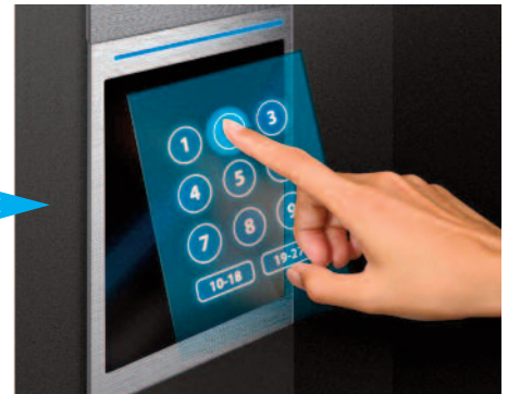
4.5" system profile means only approximately 1" will project into the elevator's interior.